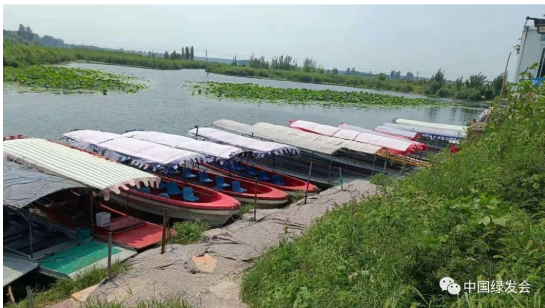
The kidney of North China - Baiyangdian wetland.