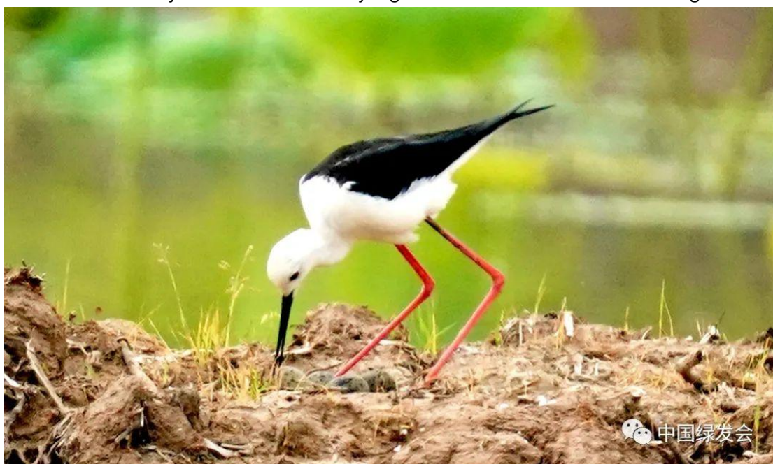
The vitality of artificial wetland of lotus root field in Hubei Province.