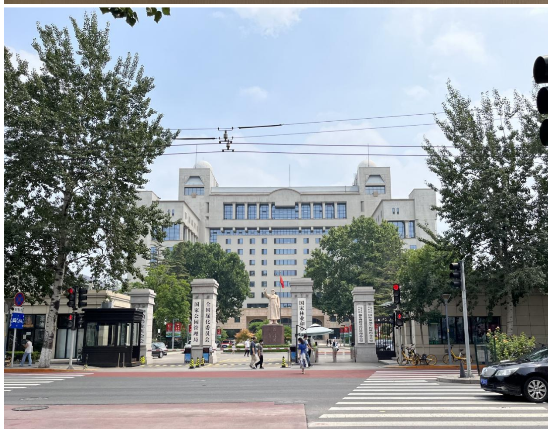
Outdoor view of the National Forestry and Grassland Administration and the Executive Committee Office of the 14th Conference of the Parties to the Convention on Wetlands